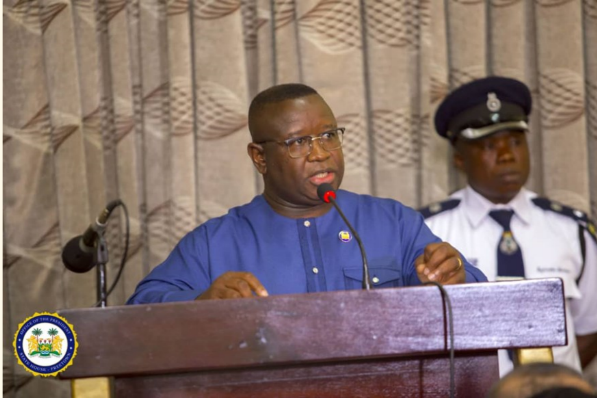
H. E. Dr. Julius Maada Bio at the Inaugural Presidential Development Partnership Committee (DEPAC) 26th February, 2019

“My Government is keen on strengthening the partnership with our development partners and making it work for our people and taxpayers of your respective countries who are providing support to Sierra Leone. We fully subscribe to the principles of mutual transparency and accountability.”