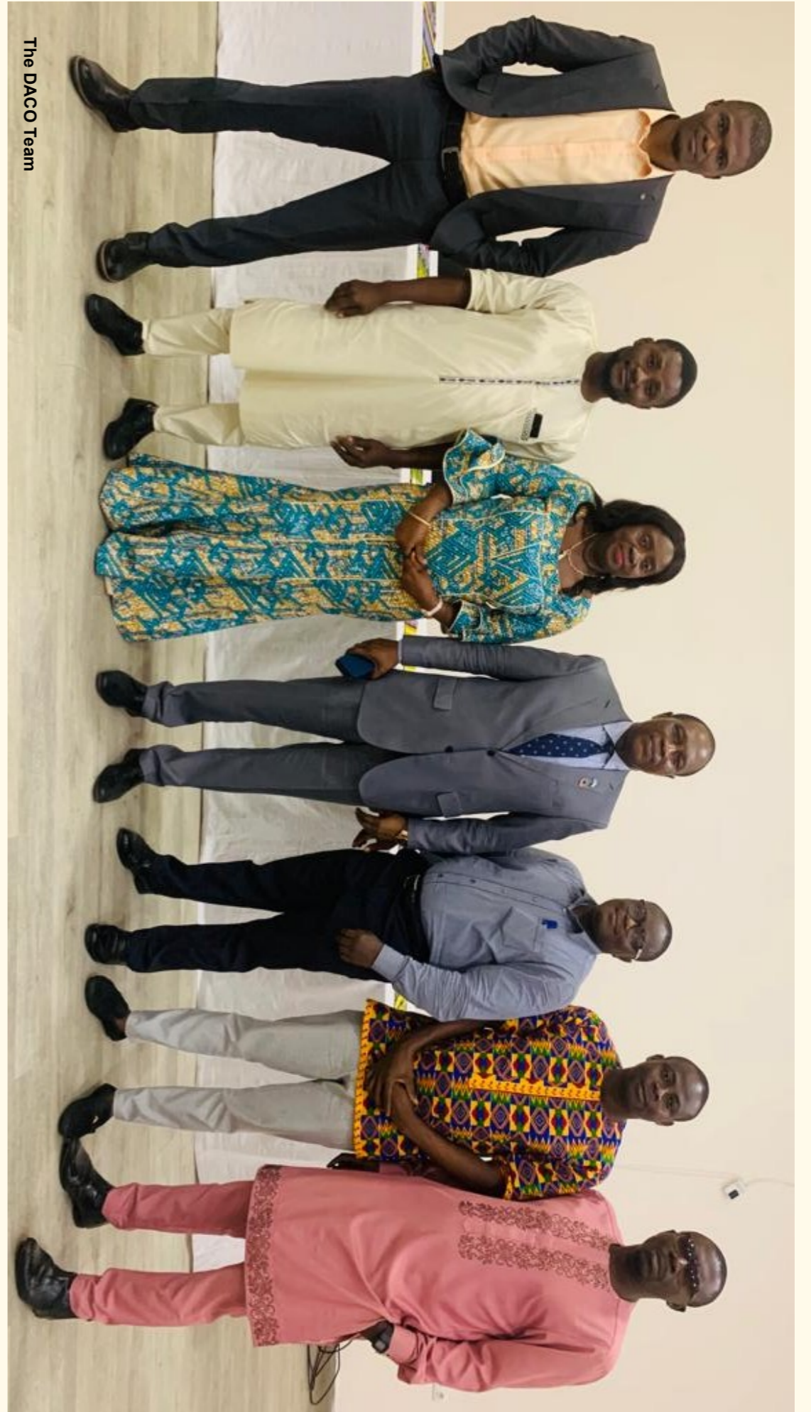
The DACO Team