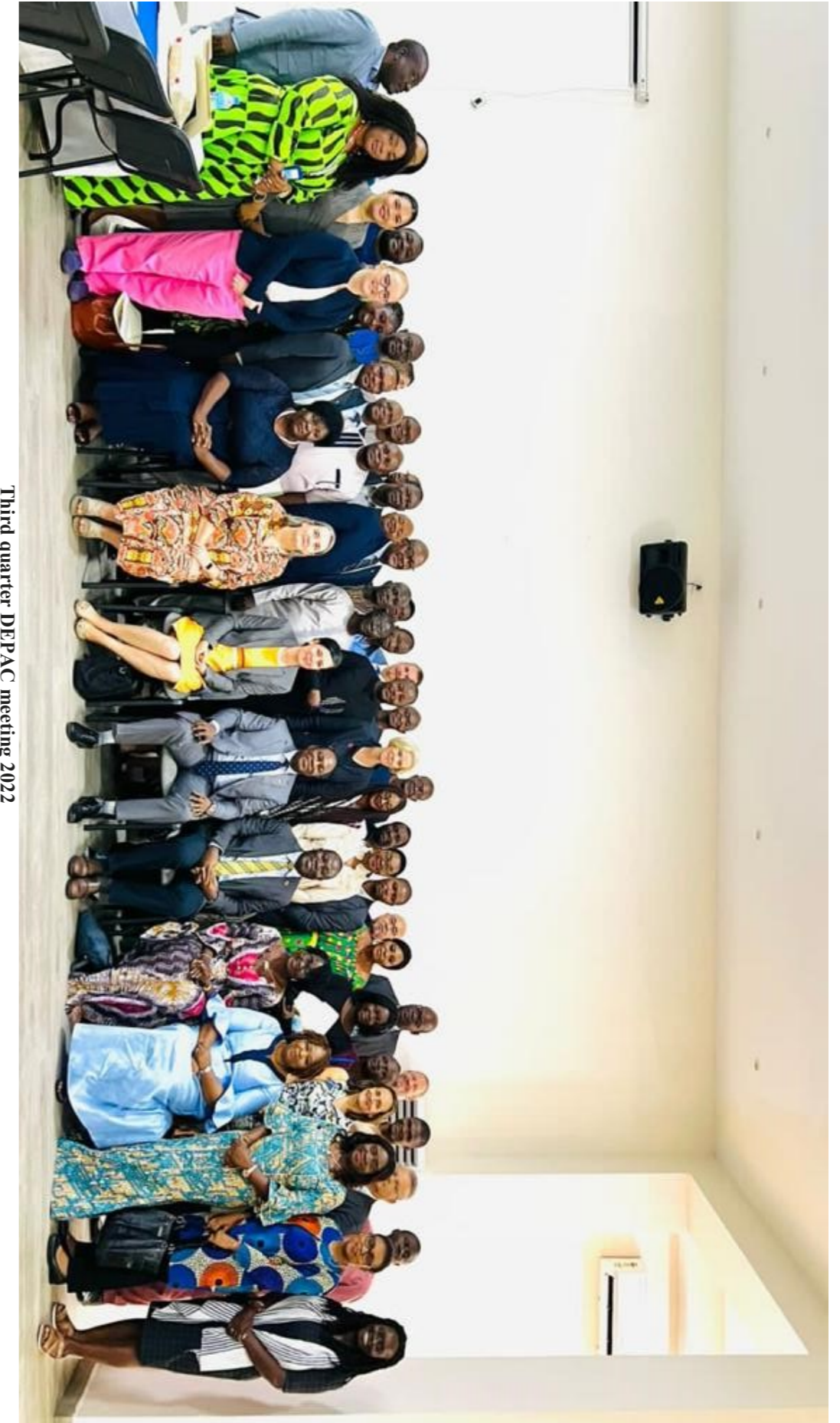
Third quarter DEPAC meeting 2022