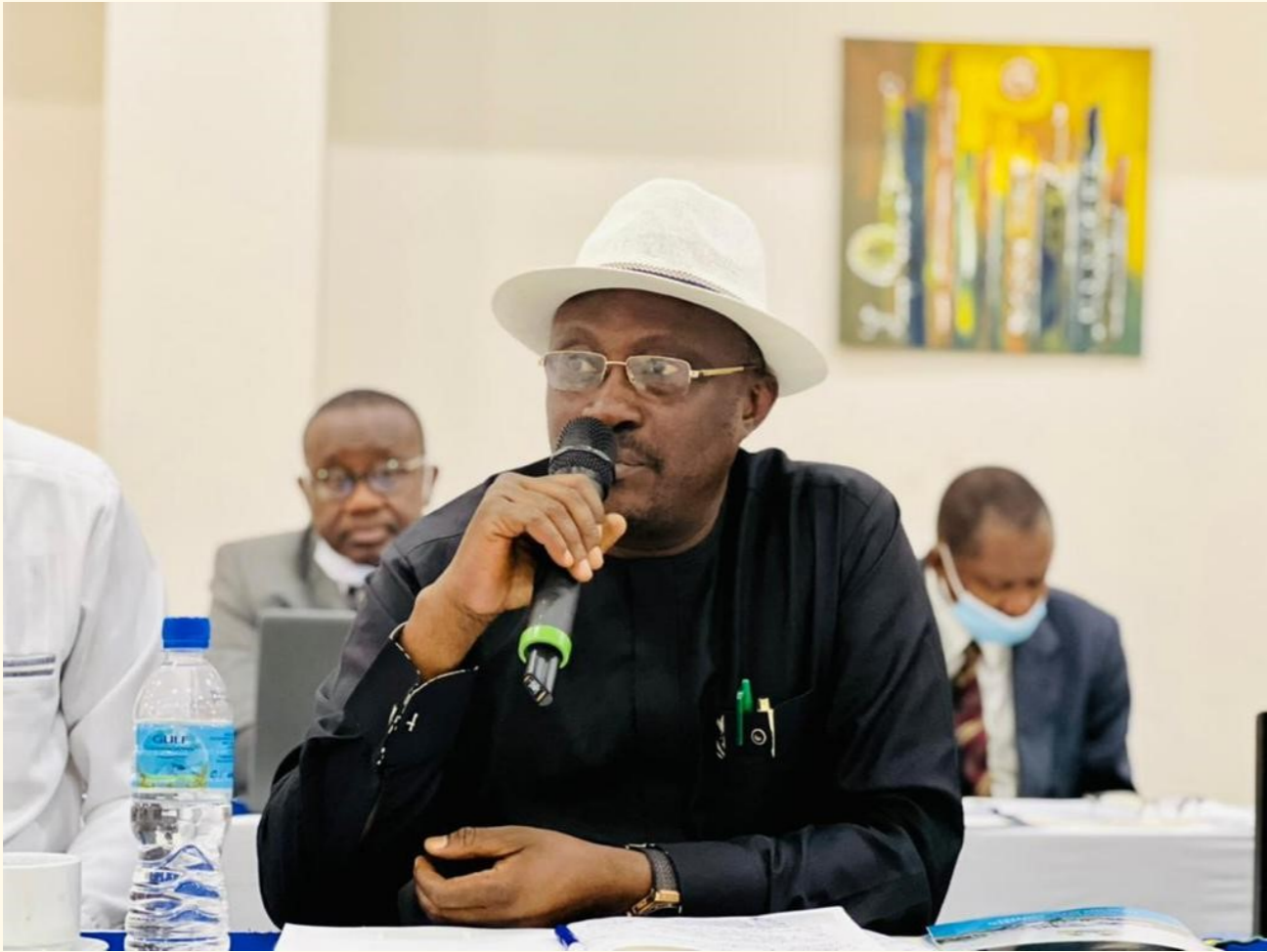
Chief Minister speaking at the first Quarter DEPAC 2022